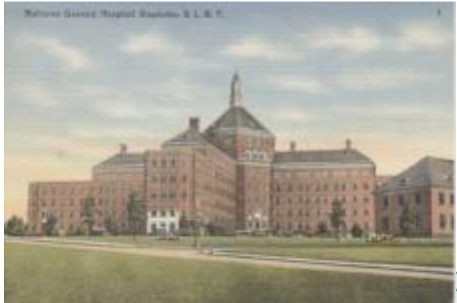
Westchester Institute for Human Development

!974, Willowbrook. The awful place with the beautiful name.